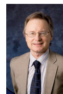
Expert presenters in the 2015 Virtual Education Program