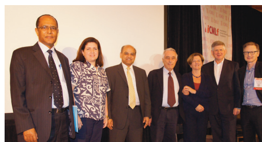
Speakers at the 2014 iCMLf Forum.

Information about CML is continually evolving. New data, guidelines, scientific publications and expert opinions are constantly available. Sharing this up to date knowledge within the international CML community is key to translating it into clinical best practice in all parts of the world. The annual iCMLf Forum for Physicians from Emerging Regions is a unique opportunity for clinicians to meet with CML experts from the iCMLf and discuss the specific challenges faced treating CML in these regions. Page 2 outlines the discussion topics at the iCMLf Forum in December 2014. The iCMLf website, www.cml-foundation.org is also a good knowledge source for up to date expert opinions and presentations through the virtual education platform. The latest topics include 'When front line TKI therapy fails' and 'Mechanisms of resistance to TKI therapy'.