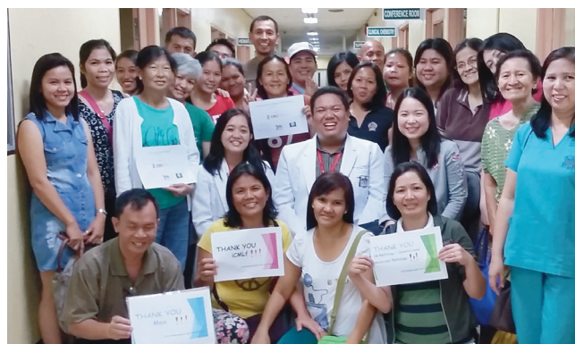
The 30 patients who received tests at the Philippine General Hospital.

Molecular monitoring of CML patients is vitally important for optimal outcomes. Unfortunately, in many parts of the world, diagnosis and monitoring of CML patients is limited by the availability and cost of molecular testing. In countries, or centres without molecular diagnostic capabilities, blood samples can be shipped to central laboratories, but this is both hampered by sample degradation, and the high costs of shipping. In country shipping costing up to $500 and international shipping $1,500, or more. In the following article we share the report from The Max Foundation in the Philippines on the recent partnership that enabled 30 patients to access PCR and mutation analysis through an international sample shipment.