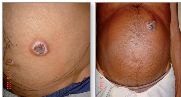
Two middle aged patients of CML at presentation with massive splenomegaly occupying the whole of the abdomen and scars of 'branding' – burning the skin over the spleen by red-hot iron rods.